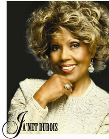
Ja'net Dubois 2010 Lifetime Achievement Award