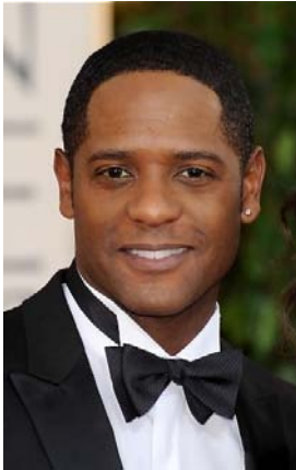
Blair Underwood 2010 Goodwill Ambassador