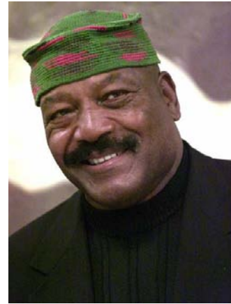
JIM BROWN 2010 THY BROTHERS' KEEPER Award